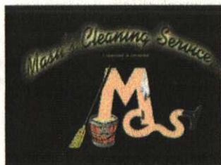
SPECIAL TO THE BREEZE

Marcus Haritos power washes the roof of one of Masu's Cleaning Service's clients in Cape Coral. The couple do all kinds of household chores from windows to pressure washing, even housesitting.